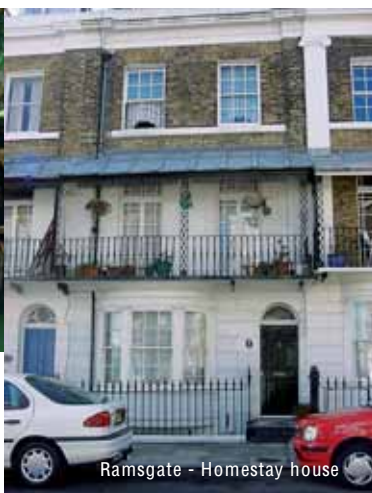
Ramsgate - Homestay house