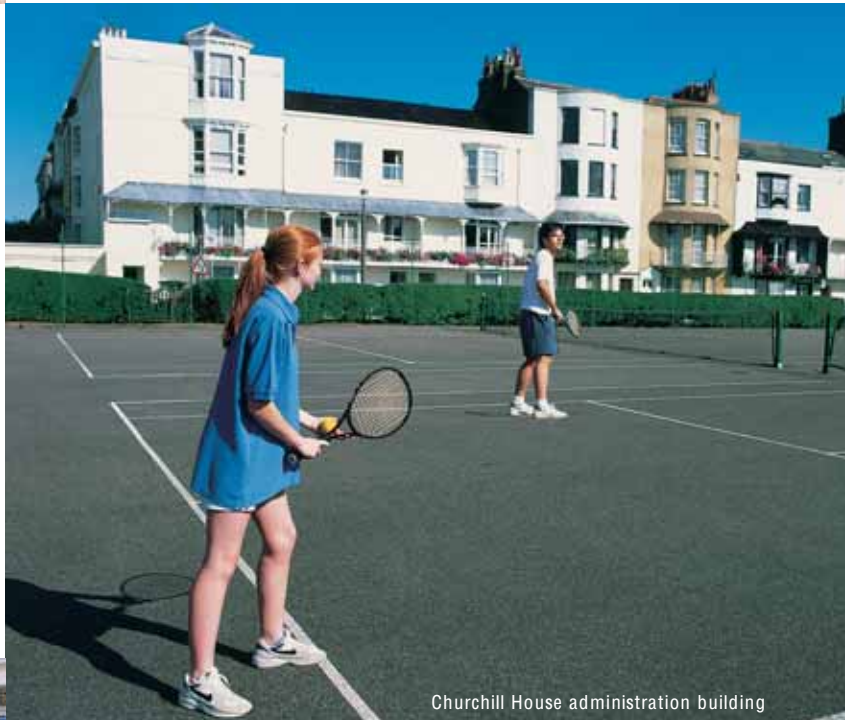
Churchill House administration building

Churchill House is big enough to guarantee professional service, small enough to guarantee you individual care and attention. From the day you arrive until the day you leave us our staff will be available to you.