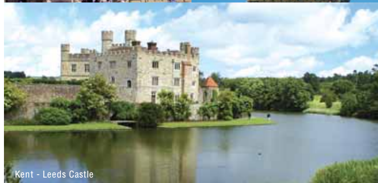
Kent - Leeds Castle