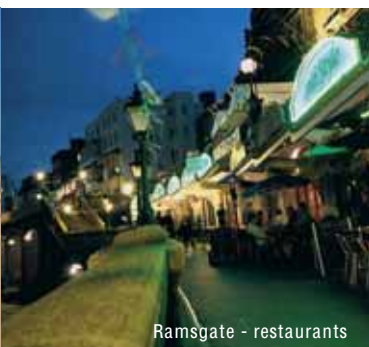
Ramsgate - restaurants