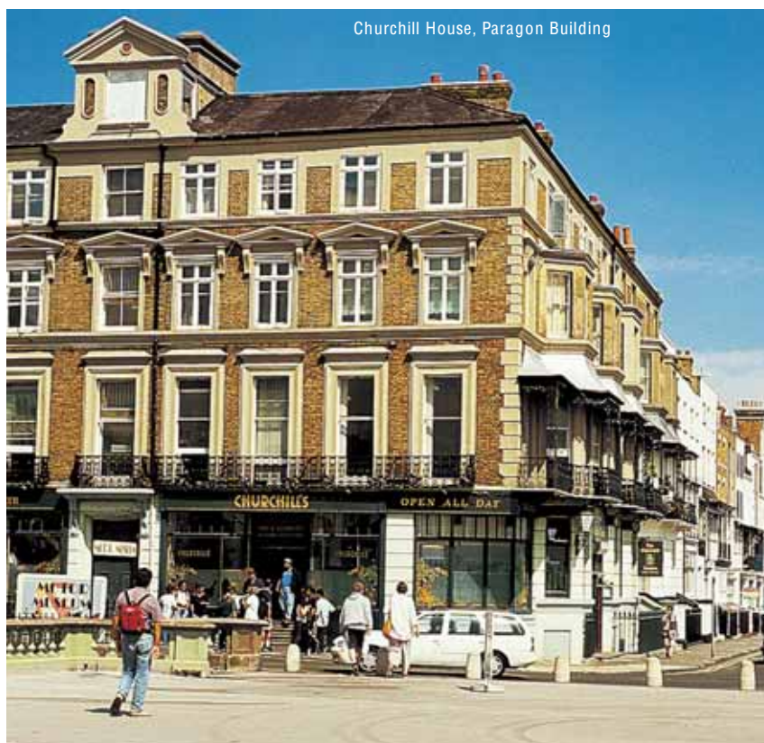
Churchill House, Paragon Building

If you want to learn English under the guidance of professional staff in a warm and informal atmosphere then Churchill House is the right choice for you. We promise to ensure that your stay here will be both successful and enjoyable.