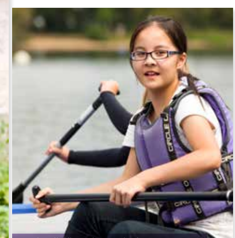
Great activities at Warminster Academy