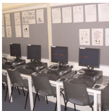
> The multimedia centre