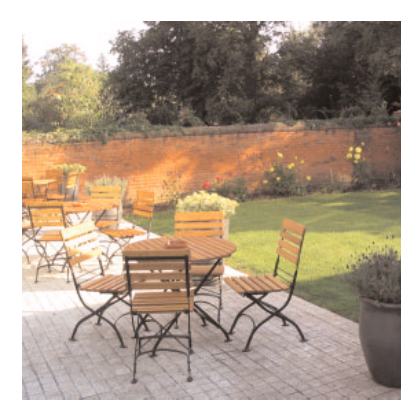
> College garden area