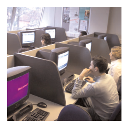
> IT centre