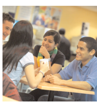
> Common room