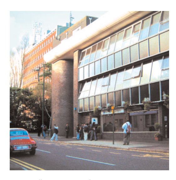
Aspect College Bournemouth