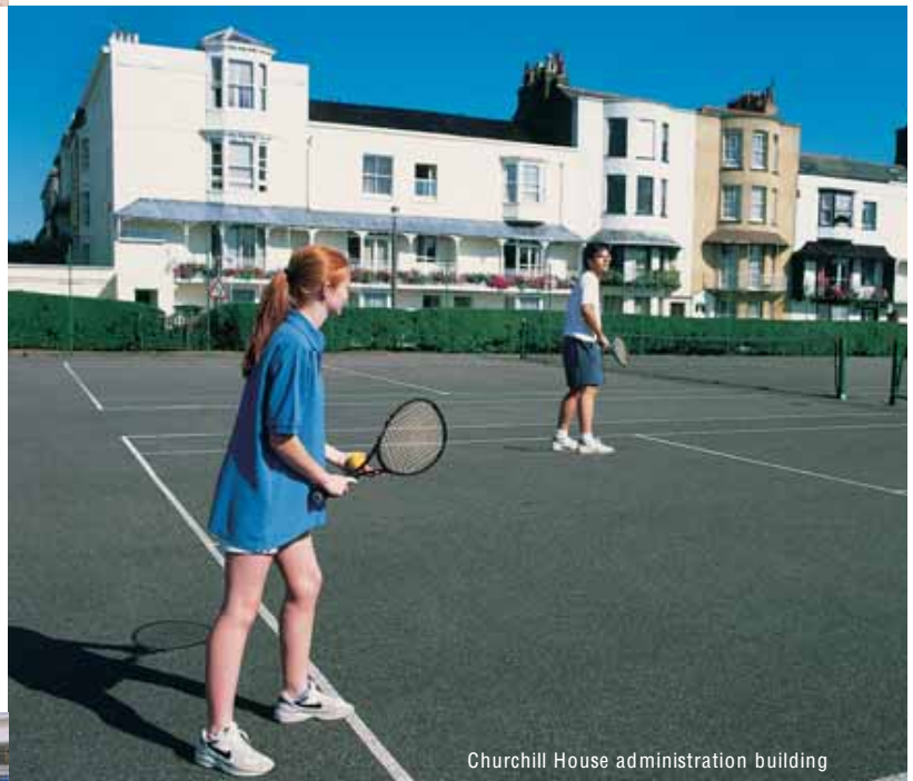
Churchill House administration building

Churchill House is big enough to guarantee professional service, small enough to guarantee you individual care and attention. From the day you arrive until the day you leave us our staff will be available to you.