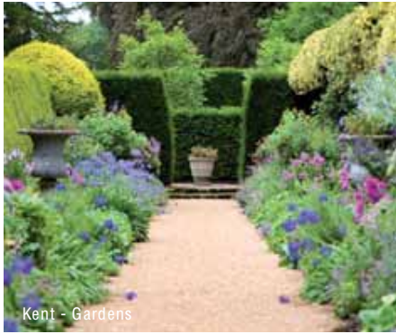
Kent - Gardens