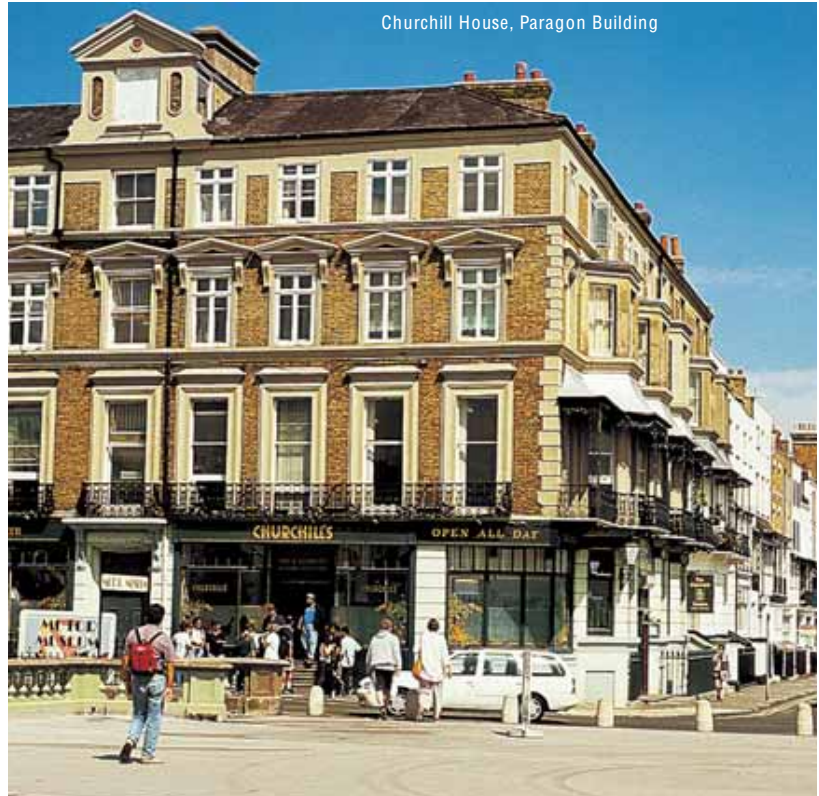
Churchill House, Paragon Building

If you want to learn English under the guidance of professional staff in a warm and informal atmosphere then Churchill House is the right choice for you. We promise to ensure that your stay here will be both successful and enjoyable.