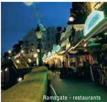
Ramsgate - restaurants