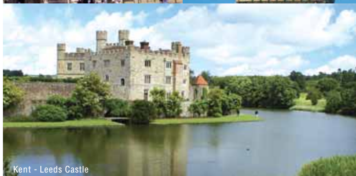
Kent - Leeds Castle