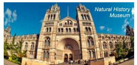
Natural History Museum