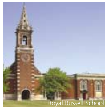
Royal Russell School