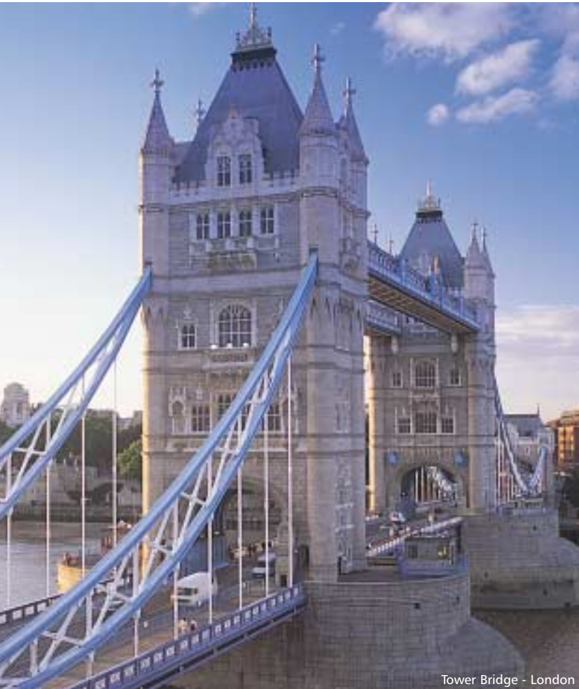
Tower Bridge - London