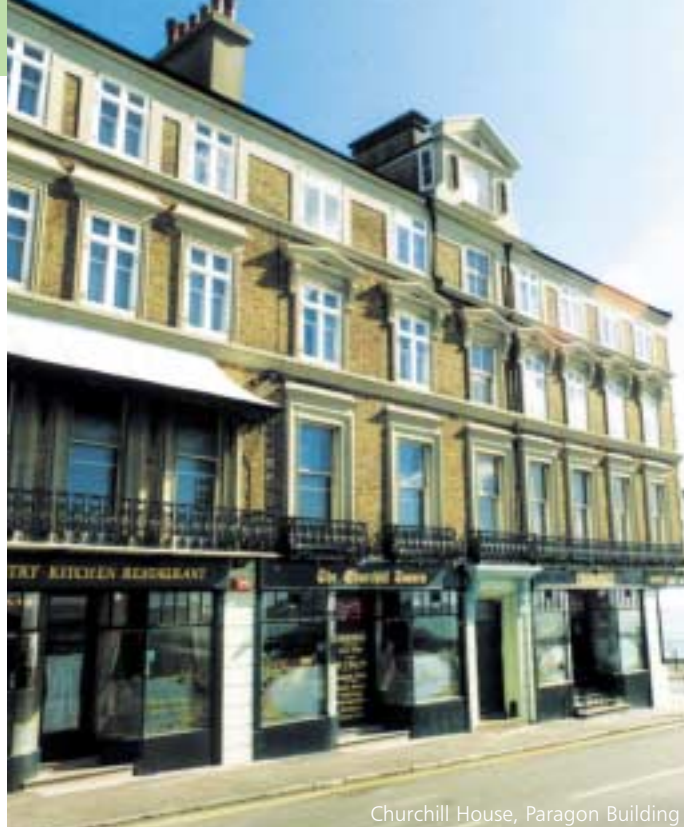
Churchill House, Paragon Building

Churchill House Ramsgate has been running English courses for young adults and adults for 34 years. The Ramsgate School is open throughout the year, so our summer vacation students benefit from the experience of our full time teaching staff. Many of our students return to us year after the year.