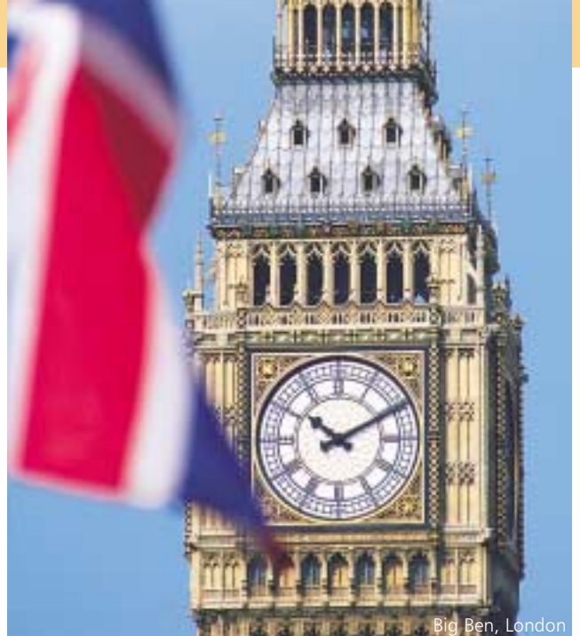
Big Ben, London

Although the activities programme is optional, we strongly recommend that you book it as part of your stay with Churchill House, as it provides a great opportunity to have fun and socialise with students from around the world.