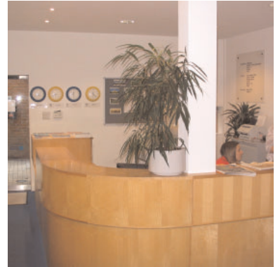
> Reception area