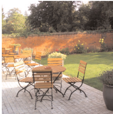
> College garden area