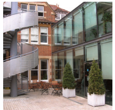
> Outside of the college cafe