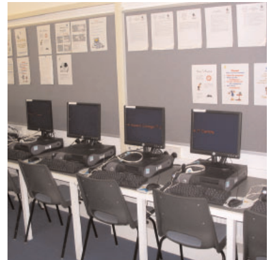
> The multimedia centre