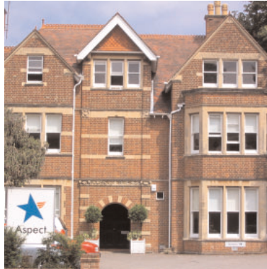
> Aspect College Oxford