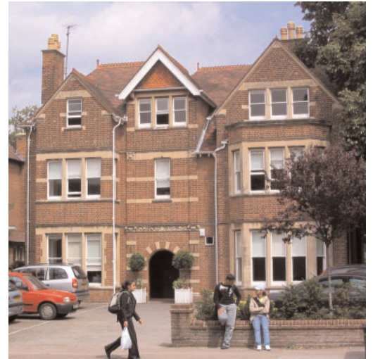
Aspect College Oxford