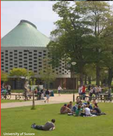
University of Sussex